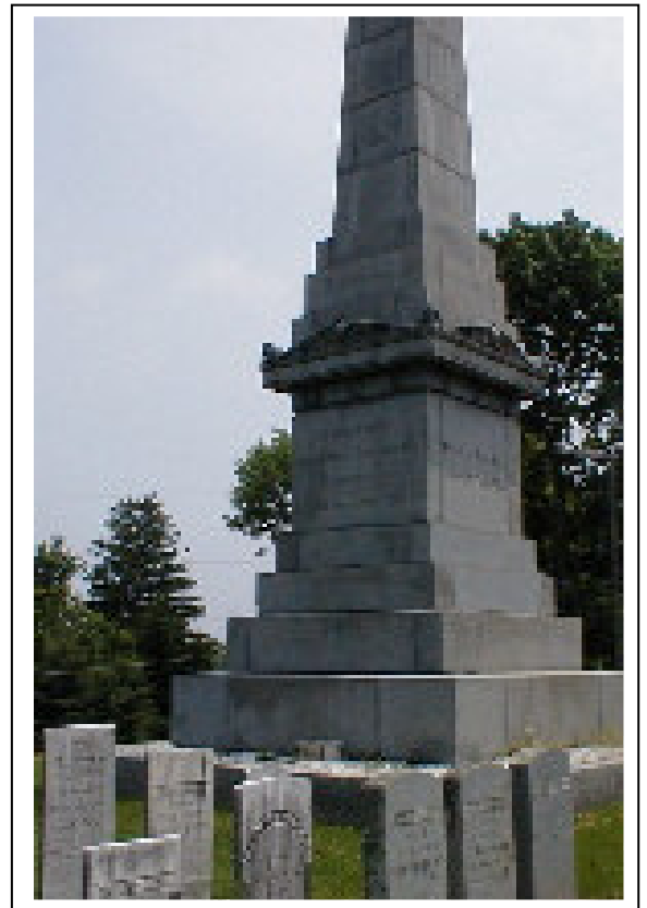
Nathan Hale Memorial Coventry, Conn.