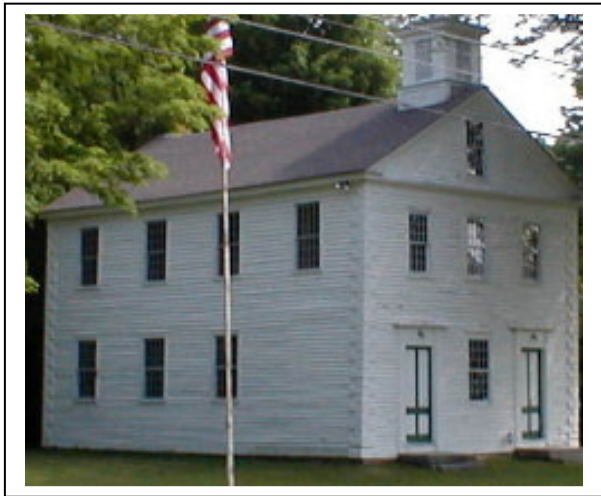
Ashford Academy on Site where James Church originally stood