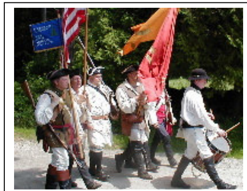
Parade participants in costume