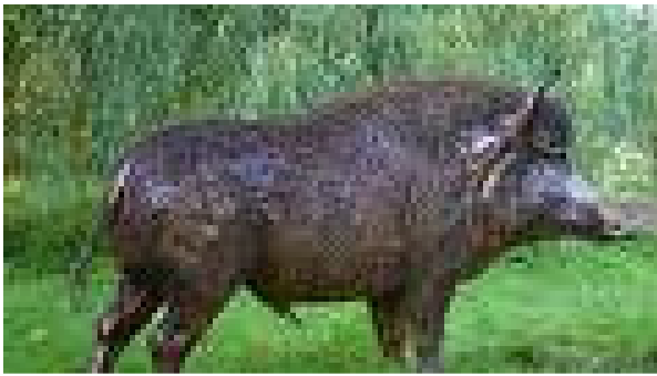
Bridget Bishop as a pig